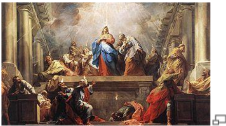
Western depiction of the Pentecost, painted by Jean Restout , 1732

In the Eastern Orthodox Church , Pentecost is one of the Orthodox Great Feasts and is considered to be the highest ranking Great Feast of the Lord, second in rank only to Pascha (Easter). The service is celebrated with an All-night Vigil on the eve of the feast day , and the Divine Liturgy on the day of the feast itself. Orthodox temples are often decorated with greenery and flowers on this feast day, and the celebration is intentionally similar to the Jewish holiday of Shavuot , which celebrates the giving of the Mosaic Law .